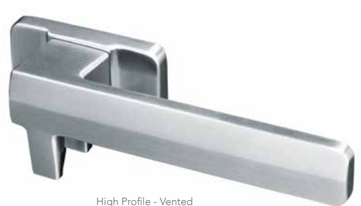
High Profile - Vented