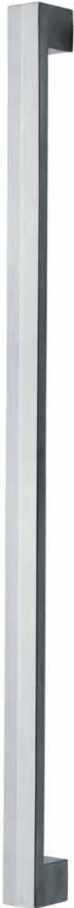
Entrance Pull Handle