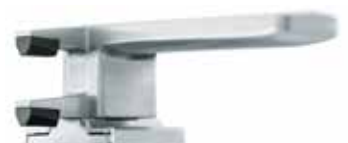
Non-marking lock tabs

Constructed from solid, 316 marine-grade stainless steel. Available in high profile (vented) or low profile options. Non-marking moulded nylon tips.